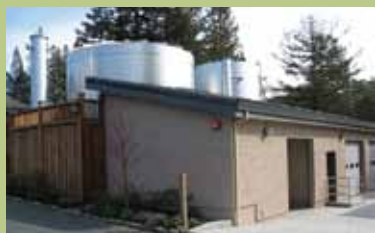
Simi's water treatment plant will have paid for itself in nearly four years.