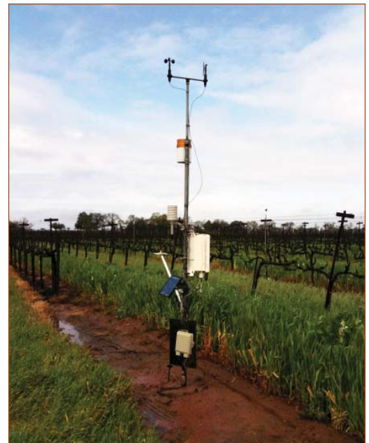
A weather station provides a daily email report that includes a mildew pressure rating, used to determine a course of action to prevent powdery mildew.

For information about the Powdery Mildew Index and the UC Statewide Integrated Pest Management Program, go to: http://www.ipm.ucdavis.edu/PMG/r302100311.html .