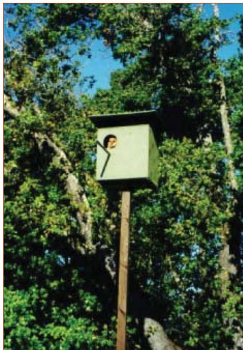
Gopher-preying owls help prevent the loss of some three dozen vines annually at Bargetto.